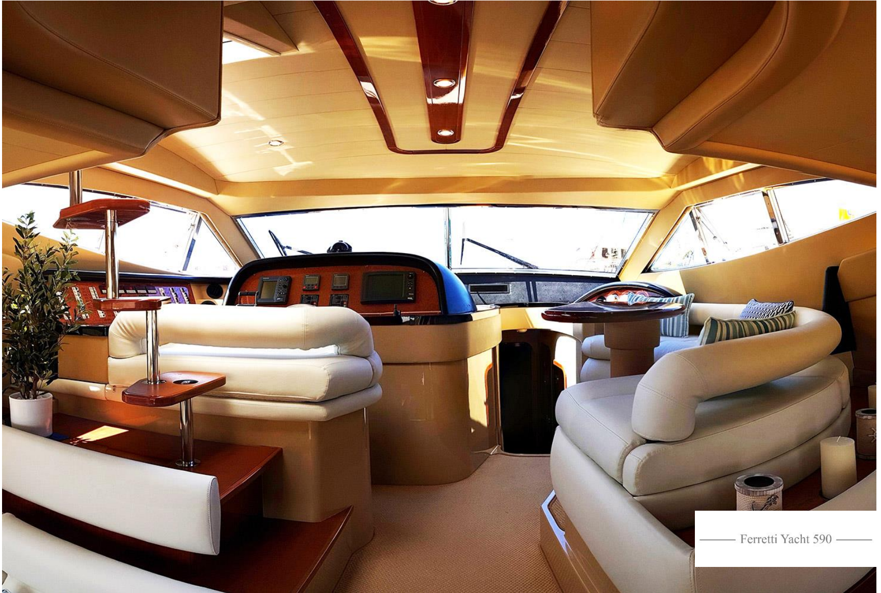
— Ferretti Yacht 590 —