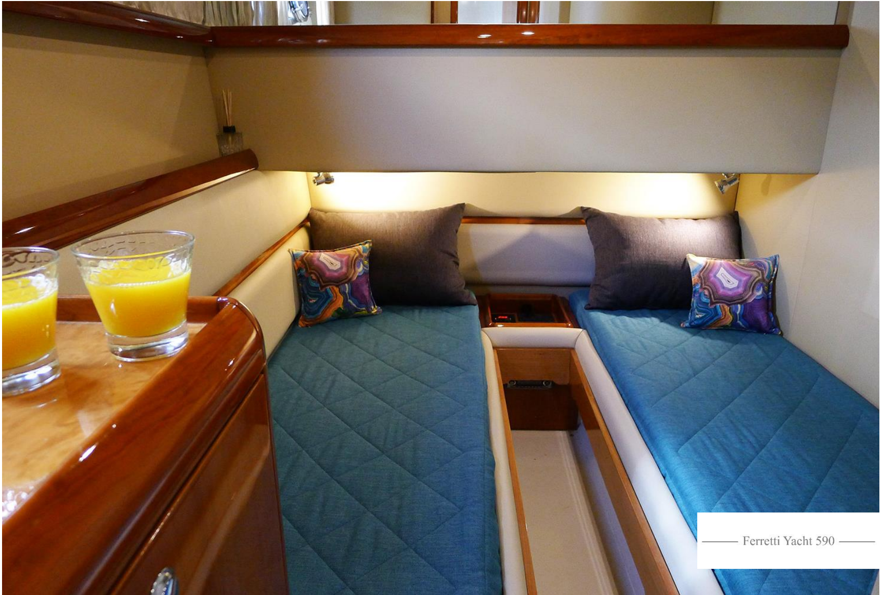
— Ferretti Yacht 590 —