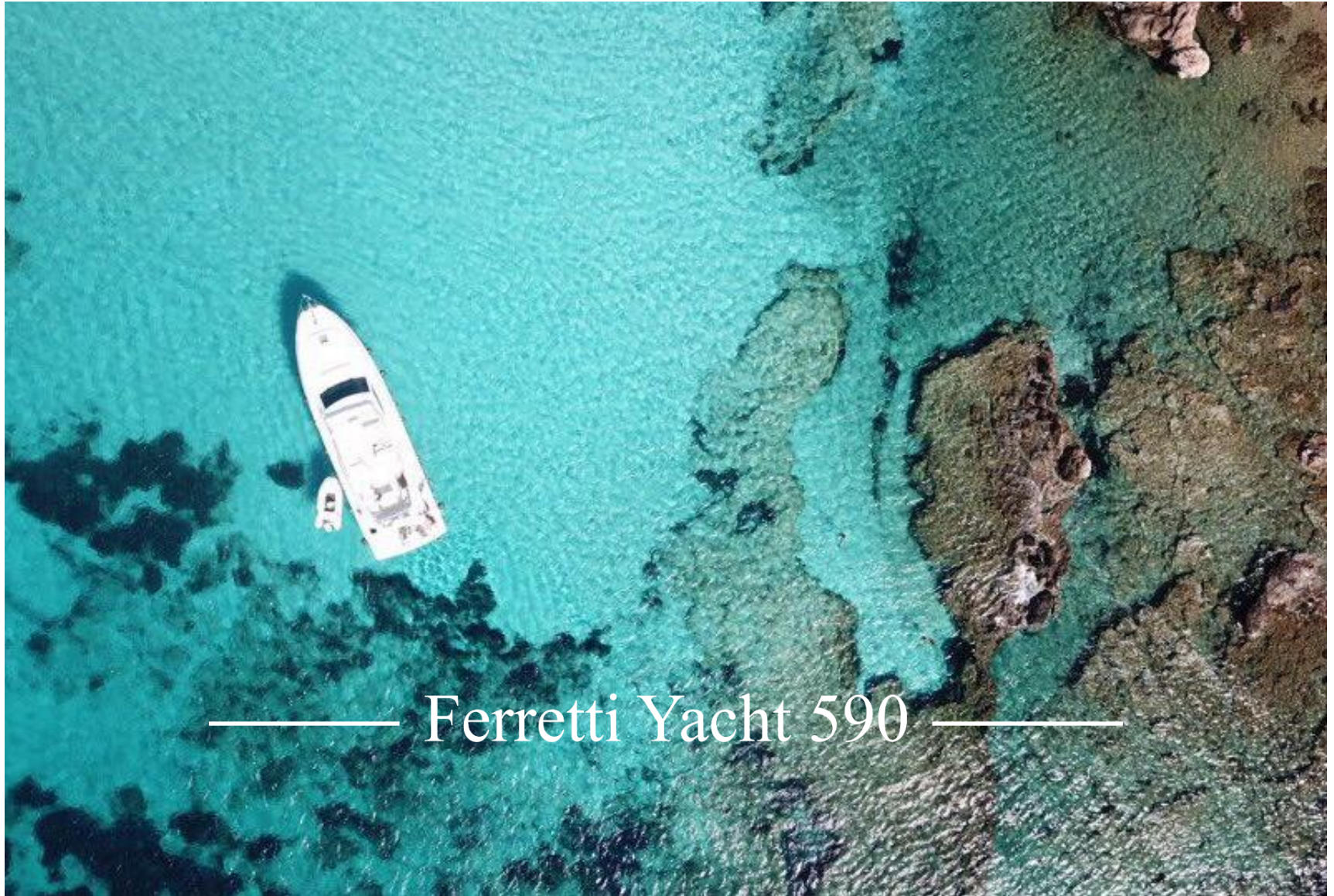
— Ferretti Yacht 590 —