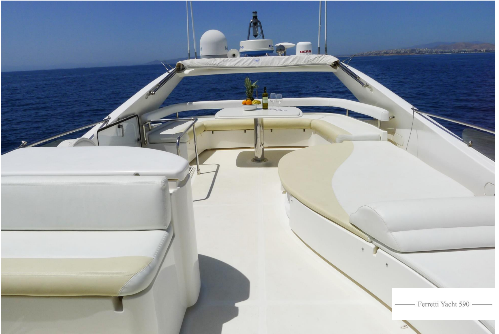
— Ferretti Yacht 590 —