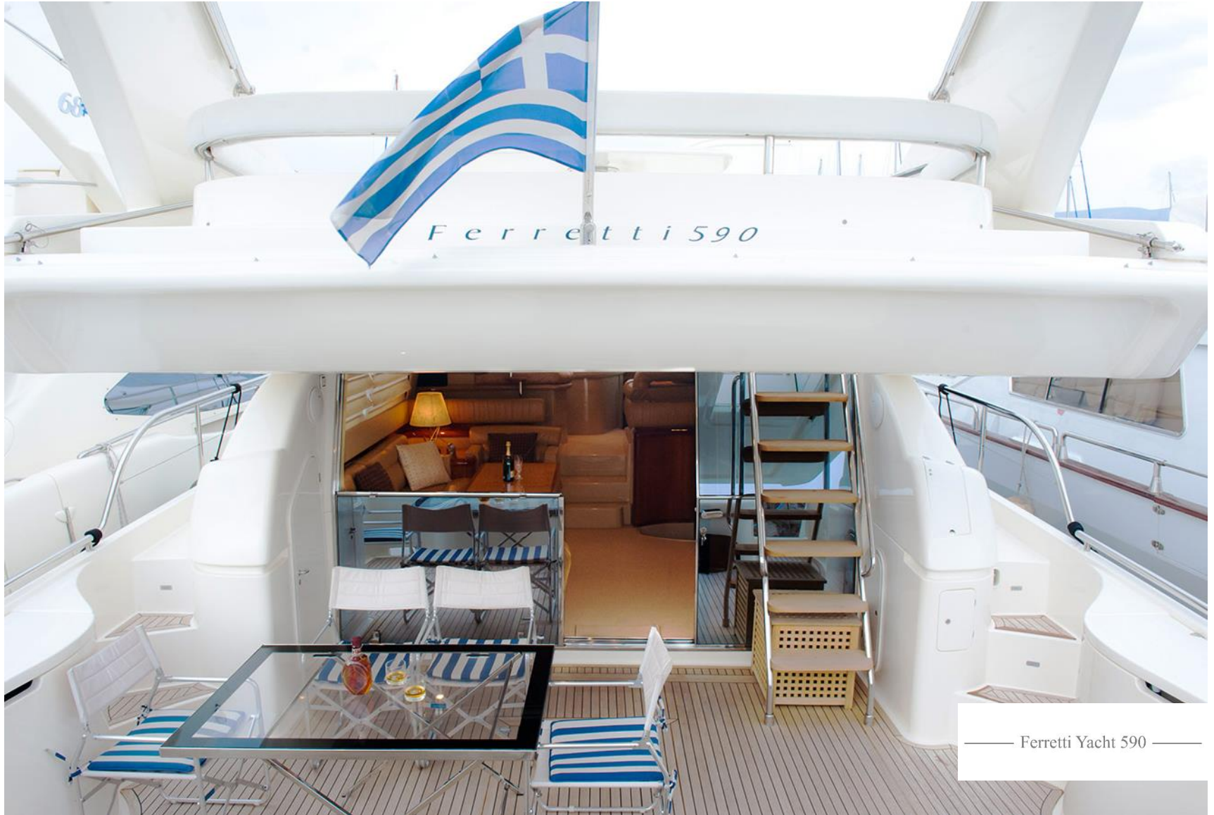
— Ferretti Yacht 590 —