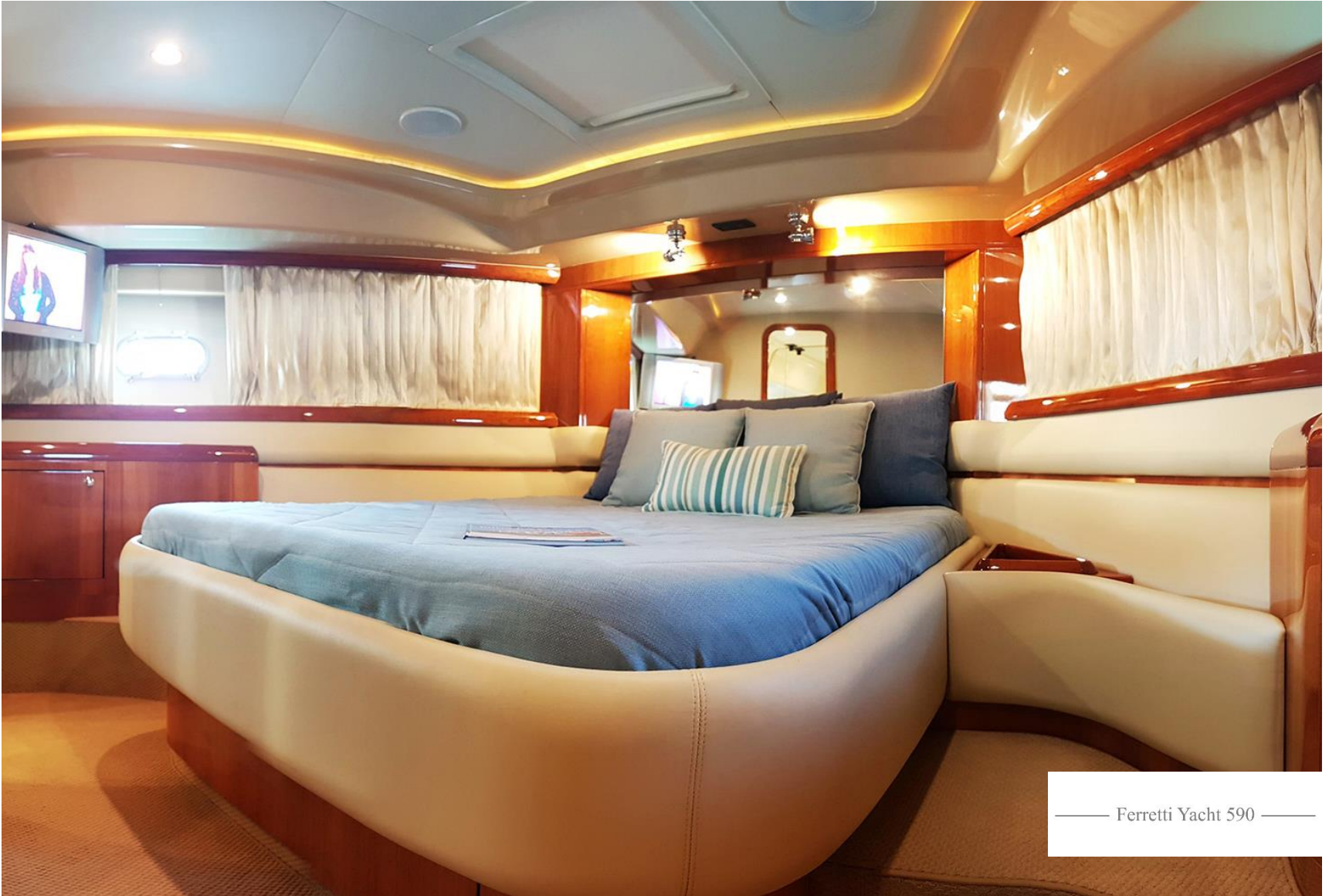
— Ferretti Yacht 590 —