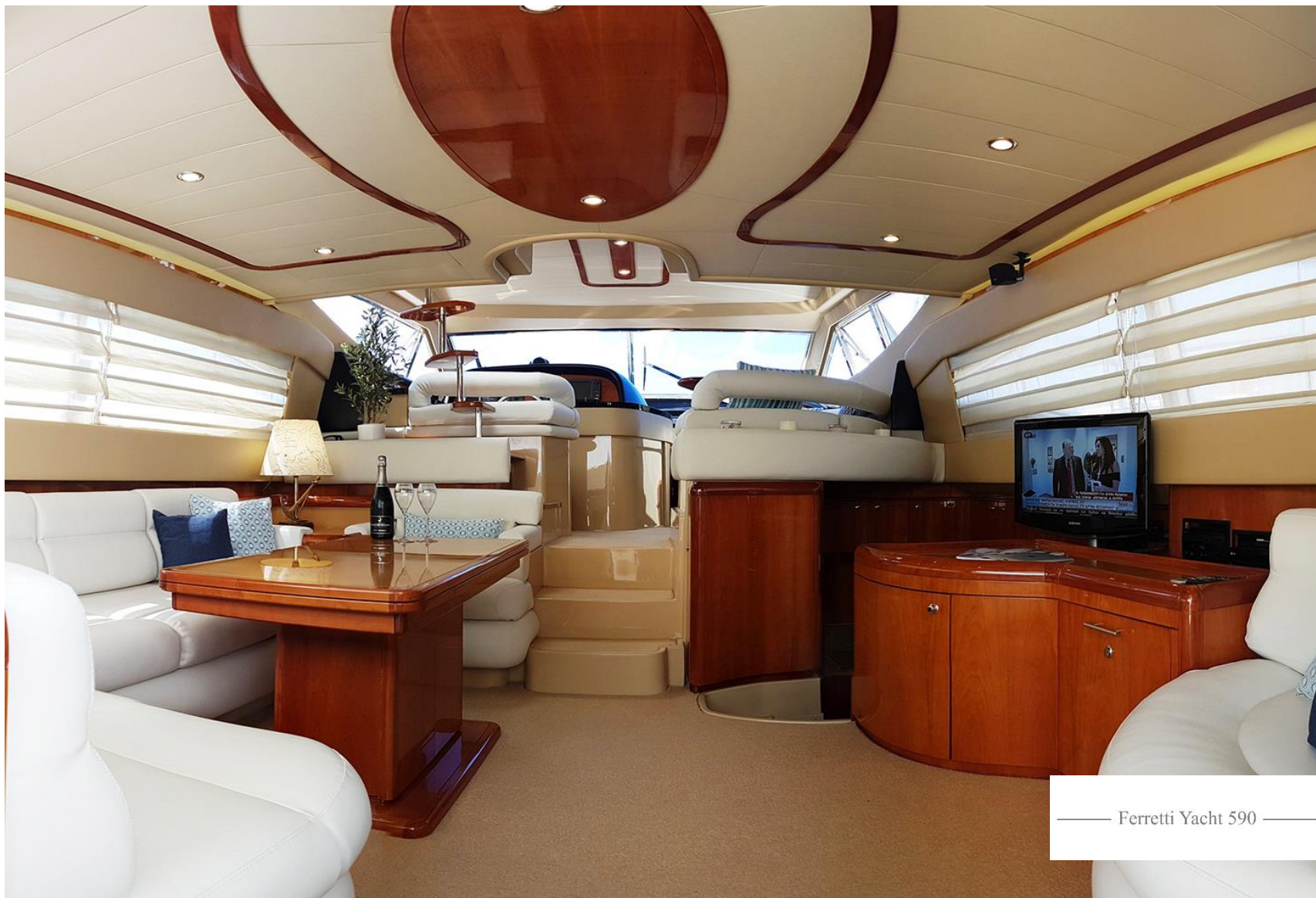
— Ferretti Yacht 590 —