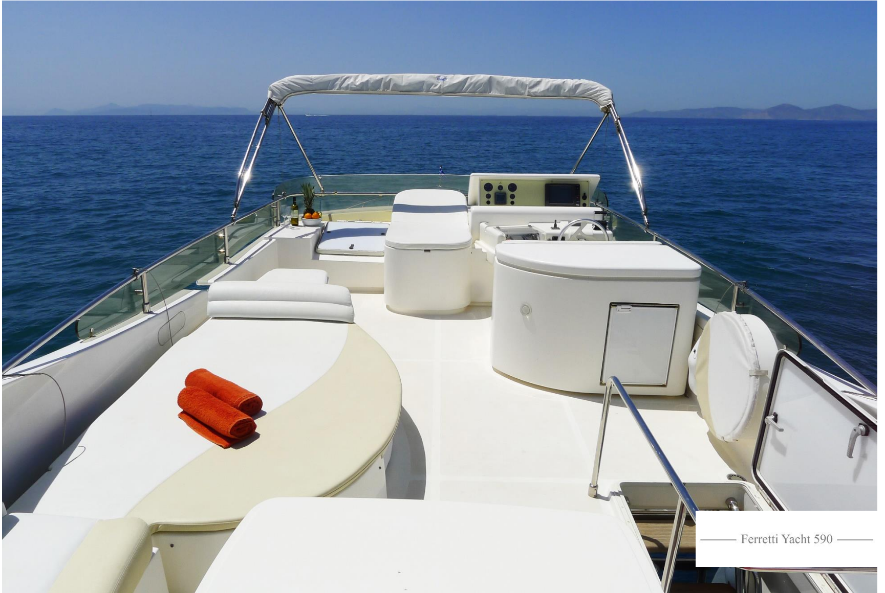
— Ferretti Yacht 590 —