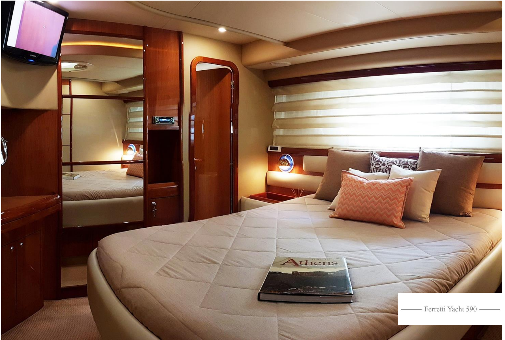
— Ferretti Yacht 590 —