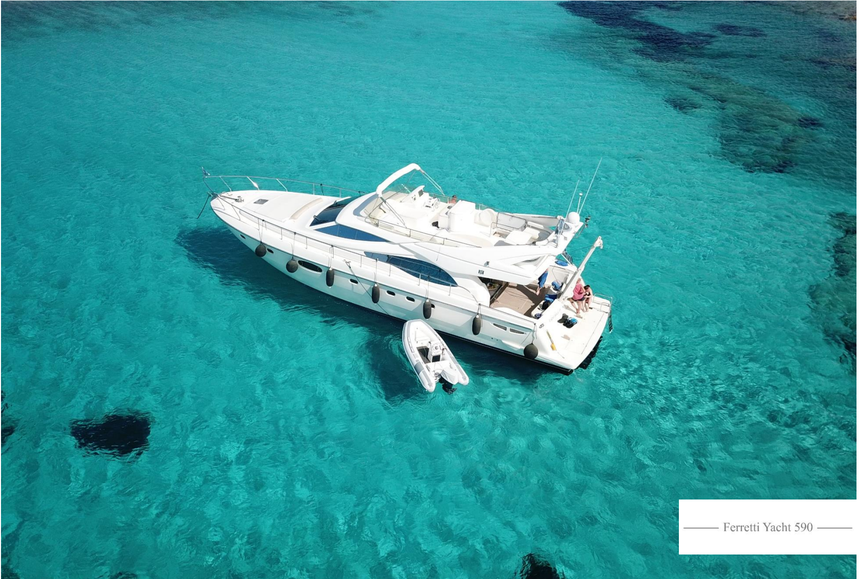
— Ferretti Yacht 590 —